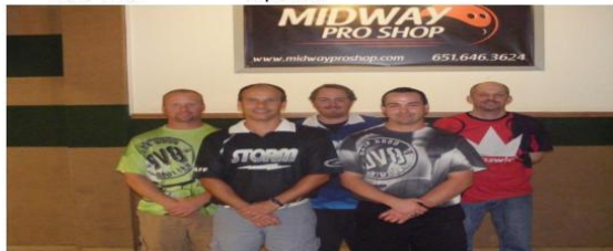
Left to Right

Plus $250.00 Added From Linds Plus $250.00 Added from DV8 Plus $156.00 Added from Midway Pro Bowl 8x25=200 Optional